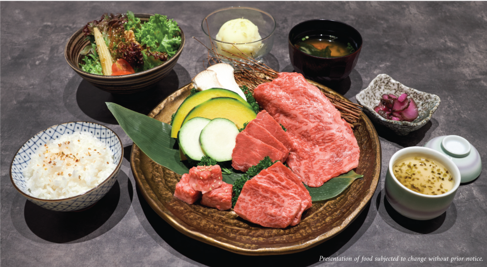
Presentation of food subjected to change without prior notice.