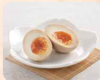
味付け卵 Ajitsuke Tamago seasoned ramen egg $2.30