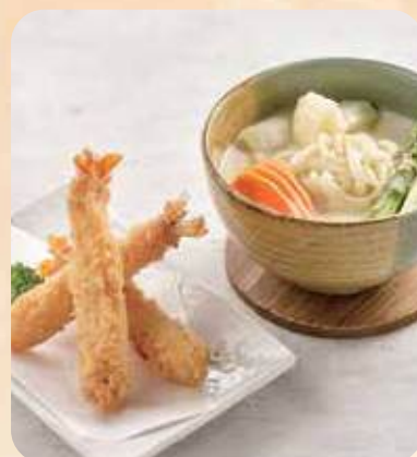
エビフライ 北海道ホワイトカレーうどん Ebi Fry Hokkaido White Curry Udon white curry udon with deep-fried prawn $15.10