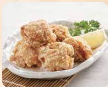
鶏唐揚げ Tori Karaage deep-fried chicken $5.90