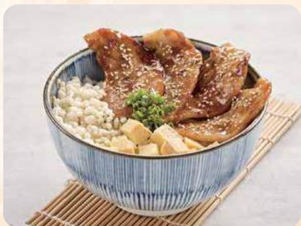
ポークベリー丼 🐷 🍳 Pork Belly Don pan-fried pork belly on rice $11.80