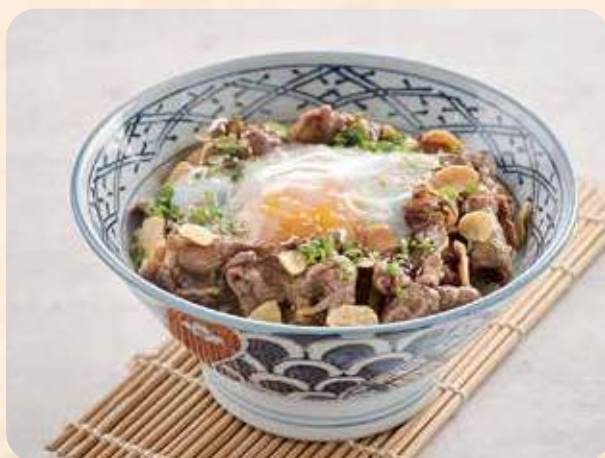
焼肉丼 🐮 🍴 Yakiniku Don pan-fried beef on rice with onsen egg $16.20