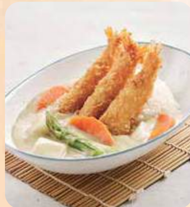
エビフライ北海道ホワイト カレーライス Ebi Fry Hokkaido White Curry Rice white curry rice with deep-fried prawn $14.00