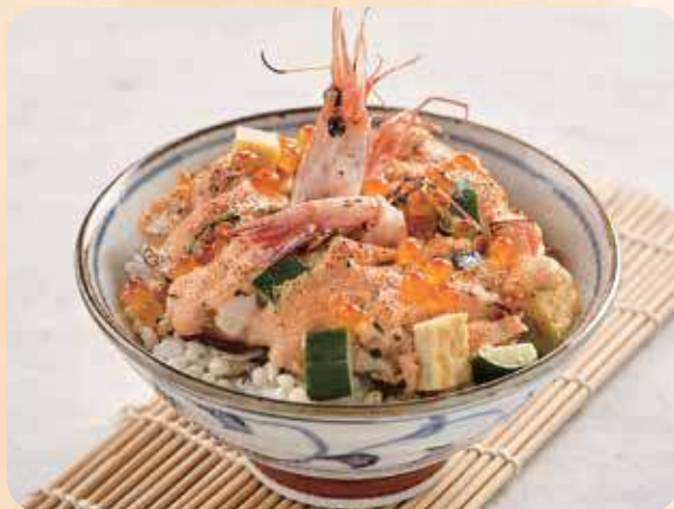
炙り明太ばらちらし丼 Aburi Mentai Bara Chirashi Don torched cubed sashimi with cod roe mayonnaise on sushi rice $19.50