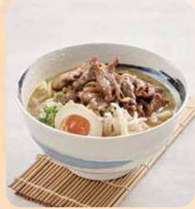
肉ラーメン (白湯/味噌/スパイシー) Niku Ramen (Paitan / Miso / Spicy) hokkaido ramen with pan-fried beef & egg $17.30