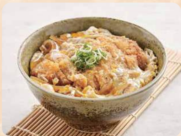
ポークカツ丼 🐷 Pork Katsu Don deep-fried pork cutlet with egg on rice $15.10