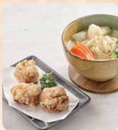
鶏唐揚げ 北海道ホワイトカレーうどん Tori Karaage Hokkaido White Curry Udon white curry udon with deep-fried chicken $11.80