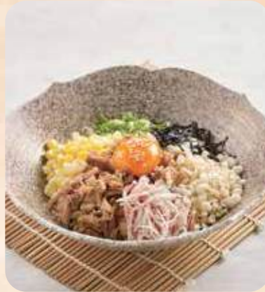
まぜうどん Mazeudon udon with roast pork, crab meat & maze sauce $11.80