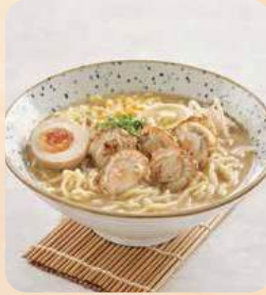
北海道バターコーン 帆立ラーメン (白湯/味噌/スパイシー) Hokkaido Butter Corn Hotate Ramen (Paitan / Miso / Spicy) hokkaido ramen with scallop, butter, corn & egg $14.00