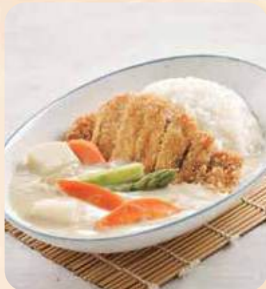
ポークカツ北海道ホワイト カレーライス 🐷👍 Pork Katsu Hokkaido White Curry Rice white curry rice with deep-fried pork cutlet $15.10