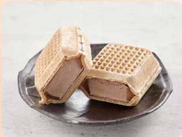
チョコレートモナカ Chocolate Monaka $4.20