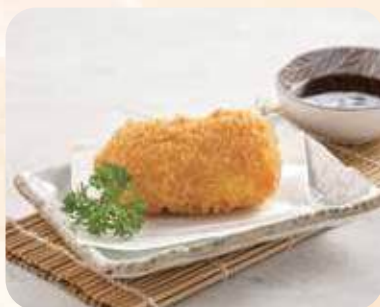
北海道コーンクリームコロケ Hokkaido Corn Cream Croquette $4.90