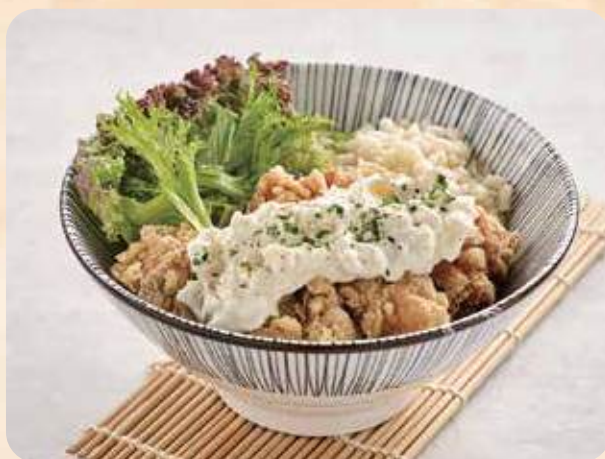
鶏唐揚げタルタル丼 Tori Karaage Tartar Don deep-fried chicken with truffle tartar sauce on rice $10.70