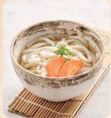
素うどん Plain Udon $7.50