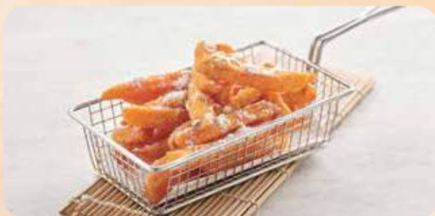
トリュフスイートポテトフライ Truffle Sweet Potato Fries $7.50