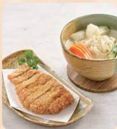
ポークカツ 北海道ホワイトカレーうどん 🐷 Pork Katsu Hokkaido White Curry Udon white curry udon with deep-fried pork cutlet $16.20