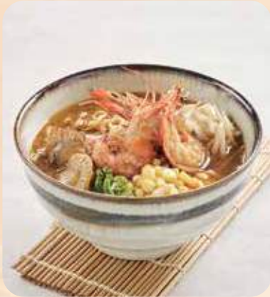
エビラーメン Ebi Ramen hokkaido ramen with tiger prawn & scallop $15.10