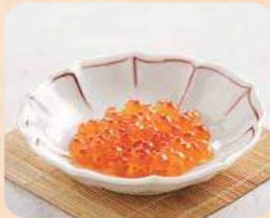
いくら醤油漬け Ikura Shoyuzuke salmon roe $5.40