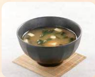
味噌汁 Miso Soup $2.70