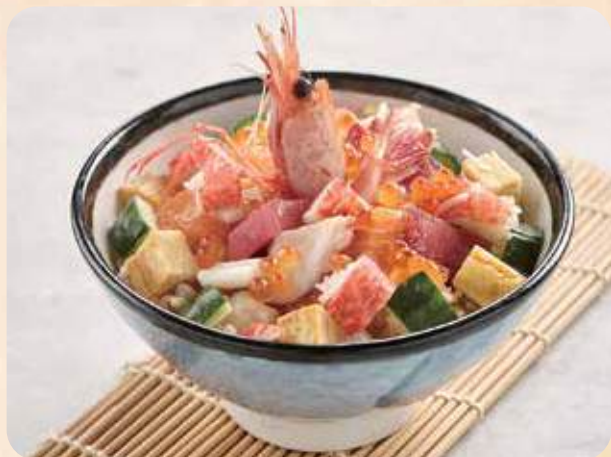
ばらちらし丼 (オリジナル/スパイシー/トリュフ) 🍡 Bara Chirashi Don (Original / Spicy / Truffle) cubed sashimi on sushi rice $18.40 (Original / Spicy) / $19.50 (Truffle)