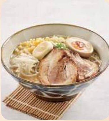
北海道バターコーン チャーシューラーメン (白湯/味噌/スパイシー) Hokkaido Butter Corn Chasyu Ramen (Paitan / Miso / Spicy) hokkaido ramen with sliced roast pork, butter, corn & egg $15.10