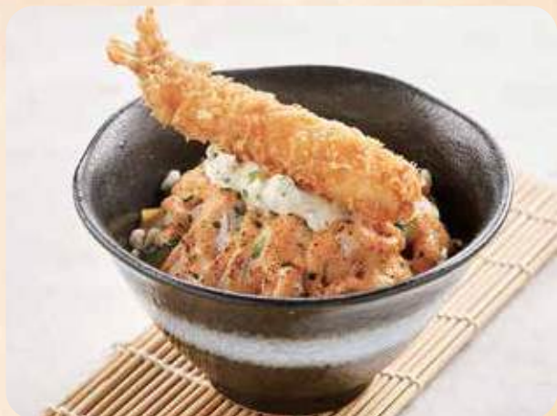
エビフライ炙り明太ばらちらし丼 Ebi Fry Aburi Mentai Bara Chirashi Don torched cubed sashimi with cod roe mayonnaise & deep-fried prawn on sushi rice $16.20