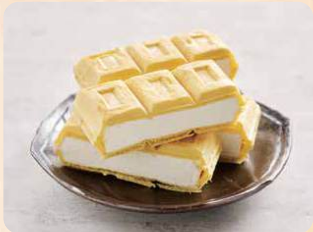
北海道ミルクモナカ Hokkaido Milk Monaka $4.20