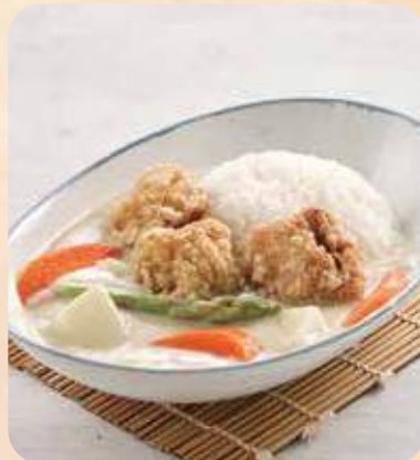
鶏唐揚げ北海道ホワイト カレーライス Tori Karaage Hokkaido White Curry Rice white curry rice with deep-fried chicken $10.70