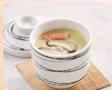
茶碗蒸し (オリジナル/いくら) Chawanmushi (Original / Ikura) steamed egg custard $3.80 (Original) / $6.40 (Ikura)