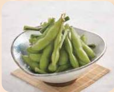
枝豆 Edamame japanese green beans $3.80