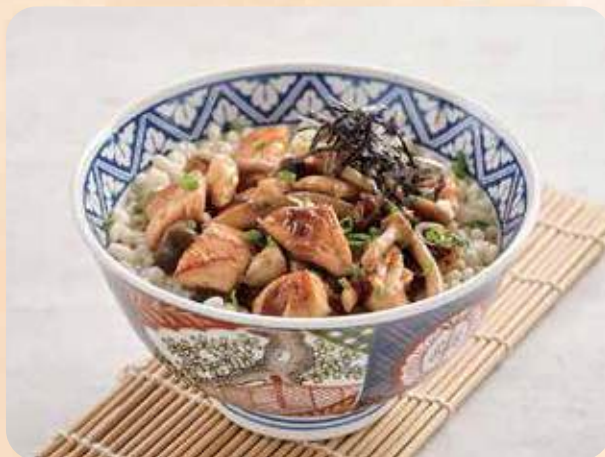
サーモンきのこ丼 Salmon Kinoko Don pan-fried salmon & mushroom on rice $14.00