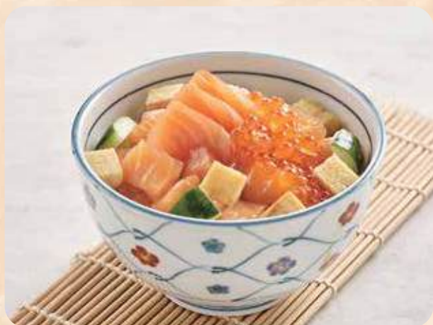
サーモン親子丼 (オリジナル/トリュフ) Salmon Oyako Don (Original / Truffle) salmon & salmon roe on sushi rice $14.00 (Original) / $15.10 (Truffle)