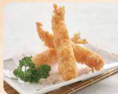
エビフライ Ebi Fry deep-fried prawn $6.40