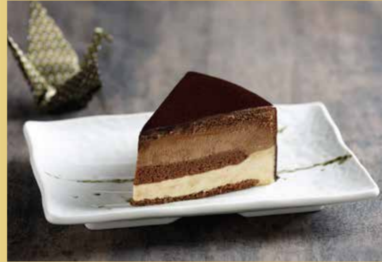
ダルゴナキャラメルコーヒケーキ Dalgona Caramel Coffee Cake