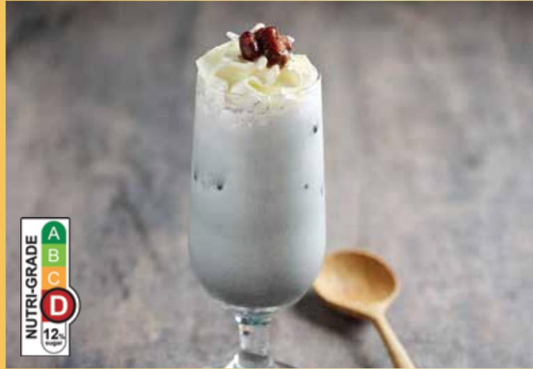
黒胡麻小豆ラテ Kuro Goma Azuki Latte black sesame milk with red bean