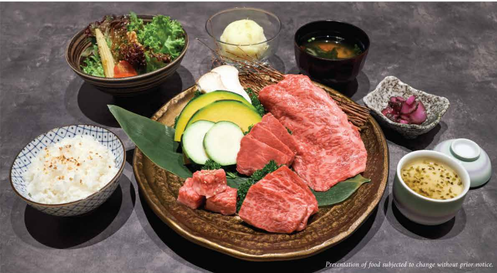
Presentation of food subjected to change without prior notice.