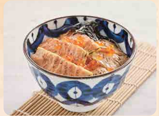
炙りサーモン玉子明太丼 Aburi Salmon Tamago Mentai Don torched salmon & omelette with cod roe mayonnaise on sushi rice $12.90