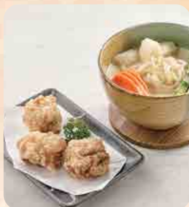
鶏唐揚げ 北海道ホワイトカレーうどん Tori Karaage Hokkaido White Curry Udon white curry udon with deep-fried chicken $10.90