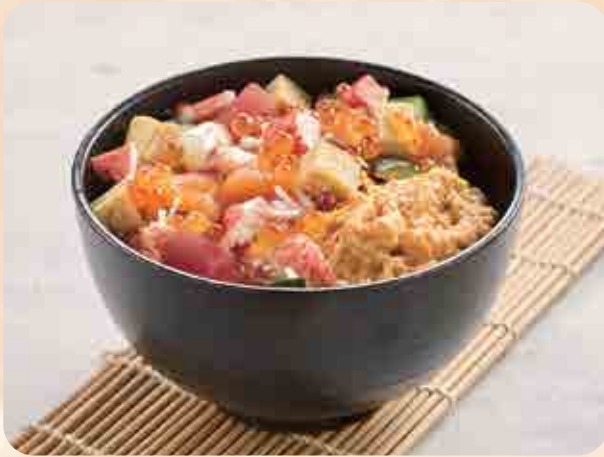
ロブスターサラダばらちらし丼 🌶️ Lobster Salad Bara Chirashi Don spicy lobster salad & cubed sashimi on sushi rice $15.90