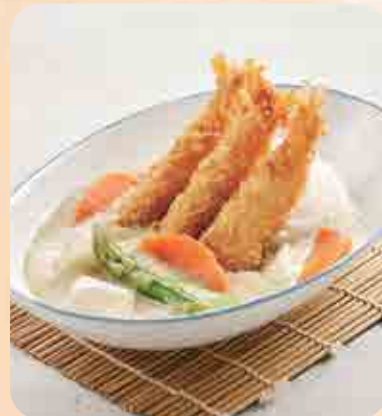
エビフライ北海道ホワイト カレーライス Ebi Fry Hokkaido White Curry Rice white curry rice with deep-fried prawn $12.90