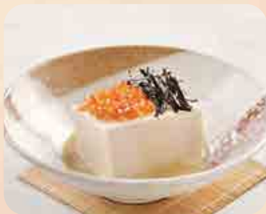
胡麻冷奴 Goma Hiyayakko cold tofu with salmon roe & sesame dressing $4.50