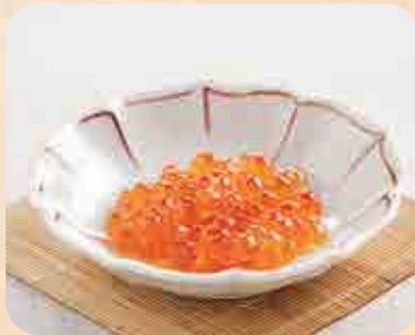
いくら醤油漬け Ikura Shoyuzuke salmon roe $5.00