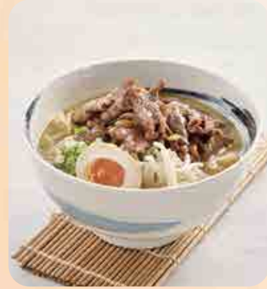
肉ラーメン (白湯/味噌/スパイシー) Niku Ramen (Paitan / Miso / Spicy) hokkaido ramen with pan-fried beef & egg $15.90