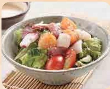
ミニ刺身サラダ Mini Sashimi Salad assorted sashimi & fresh vegetables $5.90