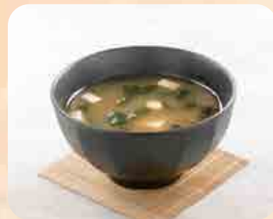
味噌汁 Miso Soup $2.50