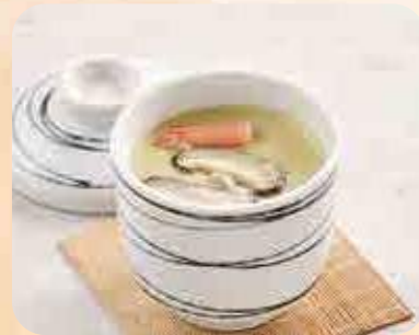
茶碗蒸し (オリジナル/いくら) Chawanmushi (Original / Ikura) steamed egg custard $3.50 (Original) / $5.90 (Ikura)