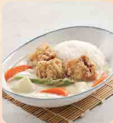
鶏唐揚げ北海道ホワイト カレーライス Tori Karaage Hokkaido White Curry Rice white curry rice with deep-fried chicken $9.90