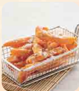
トリュフスイート ポテトフライ Truffle Sweet Potato Fries $6.90