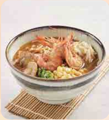
エビラーメン Ebi Ramen hokkaido ramen with tiger prawn & scallop $13.90