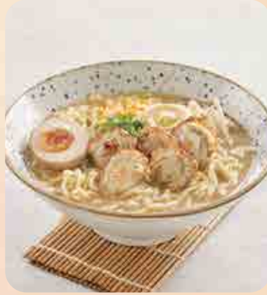
北海道バターコーン 帆立ラーメン (白湯/味噌/スパイシー) Hokkaido Butter Corn Hotate Ramen (Paitan / Miso / Spicy) hokkaido ramen with scallop, butter, corn & egg $12.90