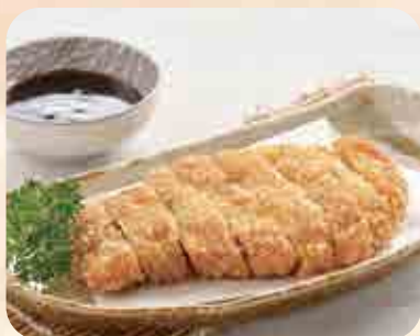
白豚ポークカツ 🐷 Shirobuta Pork Katsu deep-fried japanese pork cutlet $10.90