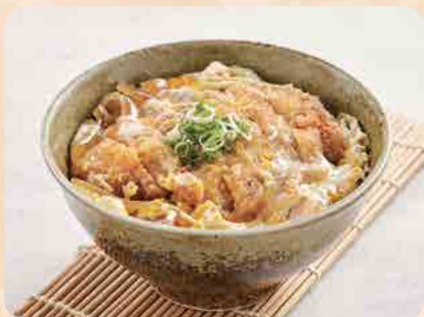
白豚ポークカツ丼 🐷 Shirobuta Pork Katsu Don deep-fried japanese pork cutlet with egg on rice $13.90