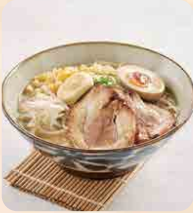
北海道バターコーン チャーシューラーメン (白湯/味噌/スパイシー) Hokkaido Butter Corn Chasyu Ramen (Paitan / Miso / Spicy) hokkaido ramen with sliced roast pork, butter, corn & egg $13.90