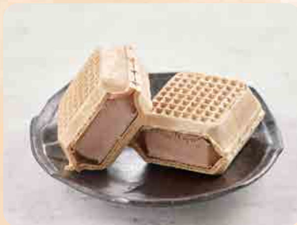
チョコレートモナカ Chocolate Monaka $3.90