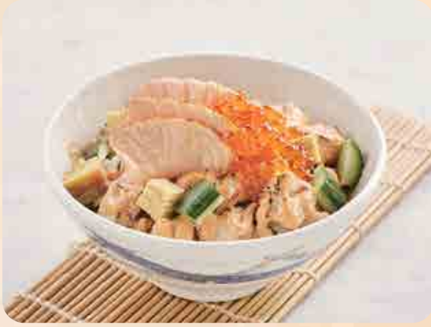
炙りサーモン親子明太丼 Aburi Salmon Oyako Mentai Don torched salmon & salmon roe with cod roe mayonnaise on sushi rice $13.90