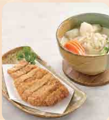
白豚ポークカツ 北海道ホワイトカレーうどん 🐷 Shiobuta Pork Katsu Hokkaido White Curry Udon white curry udon with deep-fried japanese pork cutlet $14.90