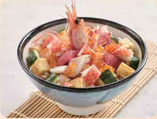
ばらちらし丼 (オリジナル/スパイシー/トリュフ) 🍷 Bara Chirashi Don (Original / Spicy / Truffle) cubed sashimi on sushi rice $16.90 (Original / Spicy) / $17.90 (Truffle)