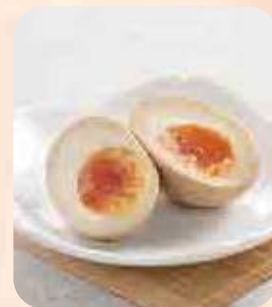
味付け卵 Ajitsuke Tamago seasoned ramen egg $2.20