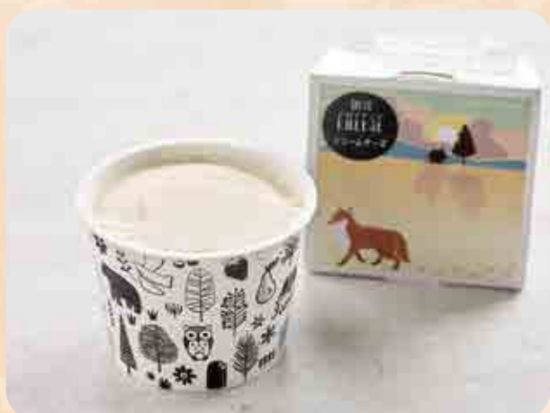
クリームチーズアイスクリーム 🐎 Cream Cheese Ice Cream made with 100% raw milk from hokkaido $6.90