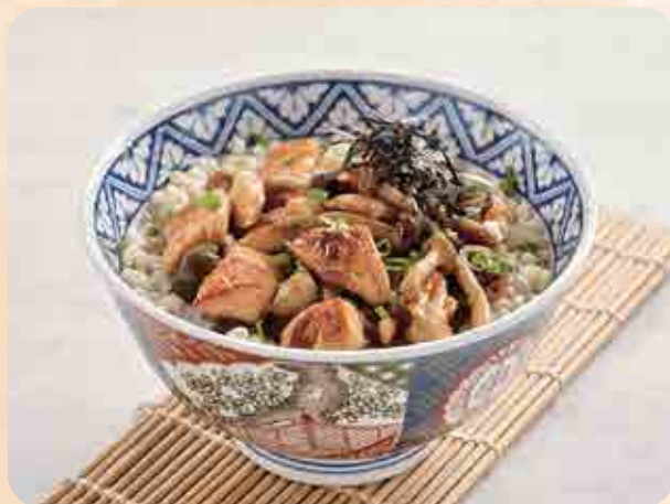
サーモンきのこ丼 Salmon Kinoko Don pan-fried salmon & mushroom on rice $12.90