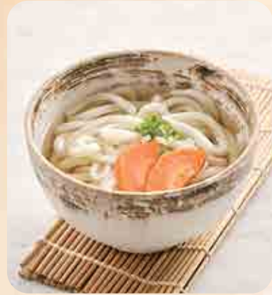
素うどん Plain Udon $6.90