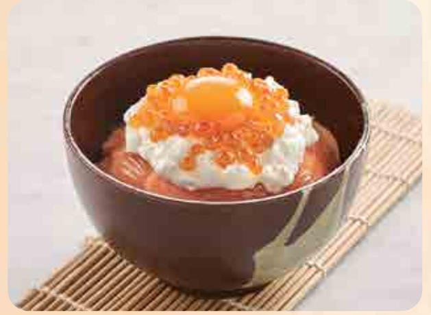
サーモン親子タルタル丼 🍷 Salmon Oyako Tartar Don salmon & salmon roe with truffle tartar sauce on sushi rice $15.90