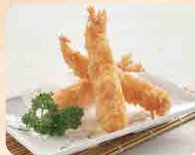
エビフライ Ebi Fry deep-fried prawn $5.90