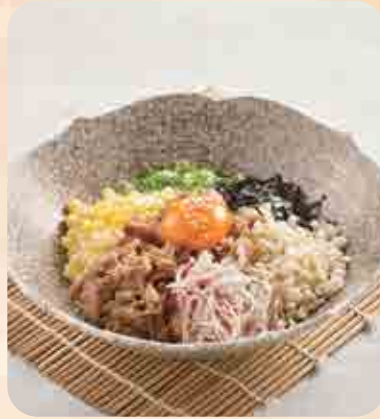
まぜうどん Mazeudon udon with roast pork, crab meat & maze sauce $10.90