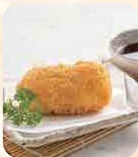
北海道コーンクリーム コロケ Hokkaido Corn Cream Croquette $4.50