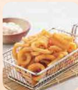
トリュフカーリー フライ 🍷 Truffle Curly Fries $5.90