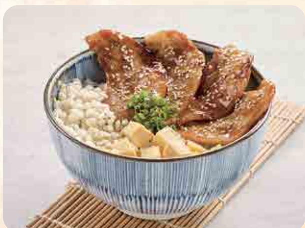
白豚ポークベリー丼 🐷 🍷 Shirobuta Pork Belly Don pan-fried japanese pork belly on rice $10.90