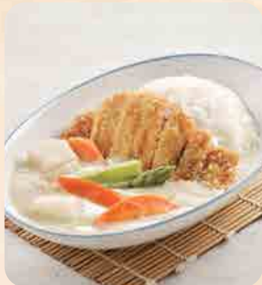
白豚ポークカツ北海道ホワイト カレーライス 🐷👍 Shiobuta Pork Katsu Hokkaido White Curry Rice white curry rice with deep-fried japanese pork cutlet $13.90