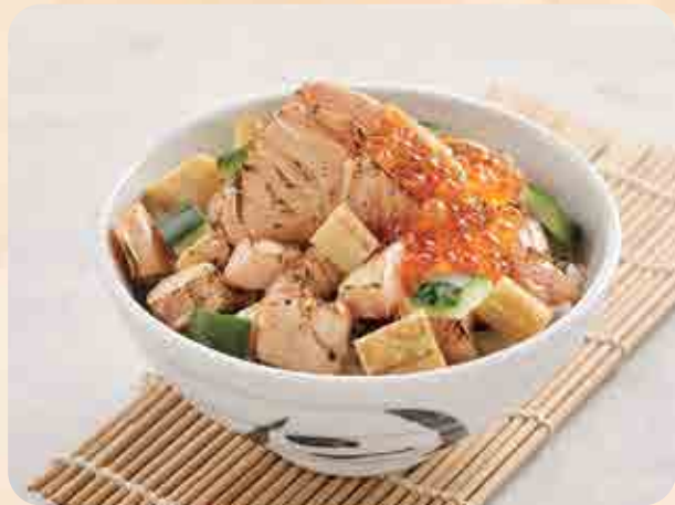
炙りサーモン親子丼 Aburi Salmon Oyako Don torched salmon & salmon roe on sushi rice $12.90