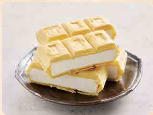
北海道ミルクモナカ Hokkaido Milk Monaka $3.90