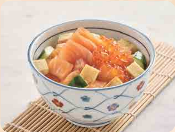
サーモン親子丼 (オリジナル/トリュフ) Salmon Oyako Don (Original / Truffle) salmon & salmon roe on sushi rice $12.90 (Original) / $13.90 (Truffle)