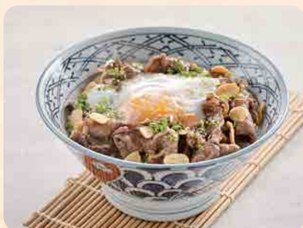
焼肉丼 🐮 🍷 Yakiniku Don pan-fried beef on rice with onsen egg $14.90