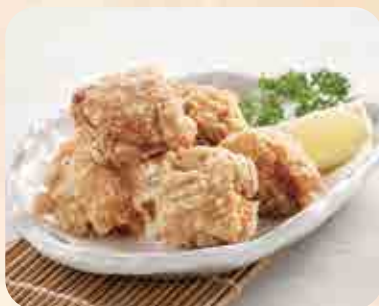
鶏唐揚げ Tori Karaage deep-fried chicken $5.50