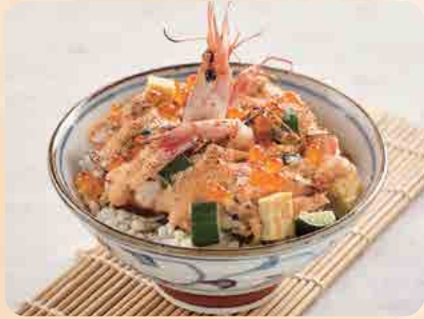
炙り明太ばらちらし丼 Aburi Mentai Bara Chirashi Don torched cubed sashimi with cod roe mayonnaise on sushi rice $17.90