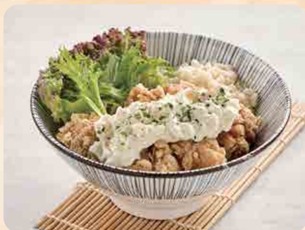
鶏唐揚げタルタル丼 Tori Karaage Tartar Don deep-fried chicken with truffle tartar sauce on rice $9.90