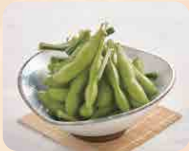
枝豆 Edamame japanese green beans $3.50