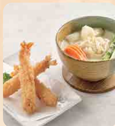
エビフライ 北海道ホワイトカレーうどん Ebi Fry Hokkaido White Curry Udon white curry udon with deep-fried prawn $13.90