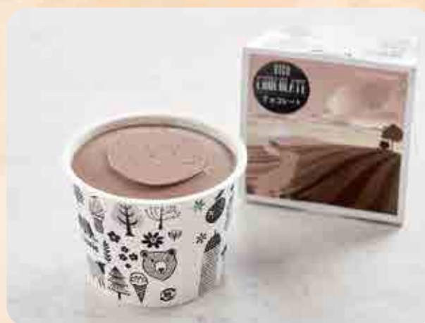
チョコレートアイスクリーム Chocolate Ice Cream made with 100% raw milk from hokkaido $6.90