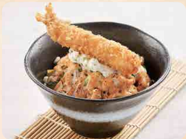
エビフライ炙り明太ばらちらし丼 Ebi Fry Aburi Mentai Bara Chirashi Don torched cubed sashimi with cod roe mayonnaise & deep-fried prawn on sushi rice $14.90